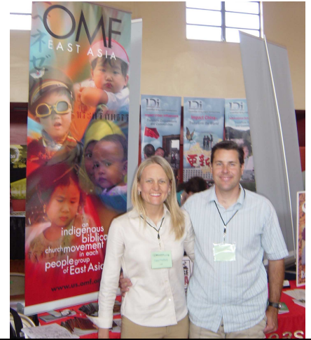
OMF's booth at the Mission Expo on April 28 at Pomona First Baptist Church